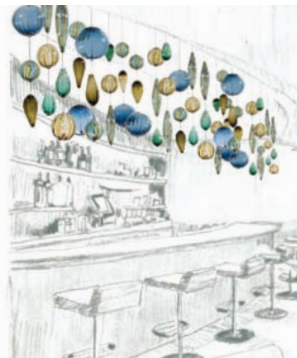
Jewel Box Pendant Installation (decorative/non-illuminated)