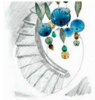
Jewel Box Pendant (illuminated canopy in stairwell)