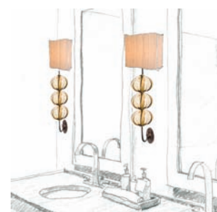
Jewel Box Sconces (illuminated shades)