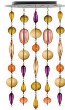
Jewel Box Pendant (illuminated elliptical canopy)