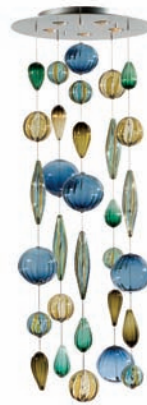
Jewel Box Pendant (illuminated circular canopy)