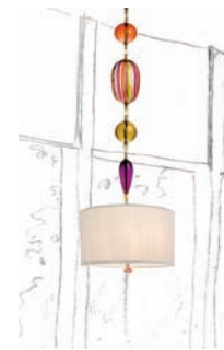
Jewel Box Pendant (illuminated shade)