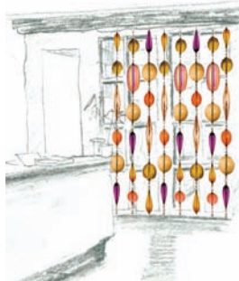
Jewel Box Window Installation (tensioned)